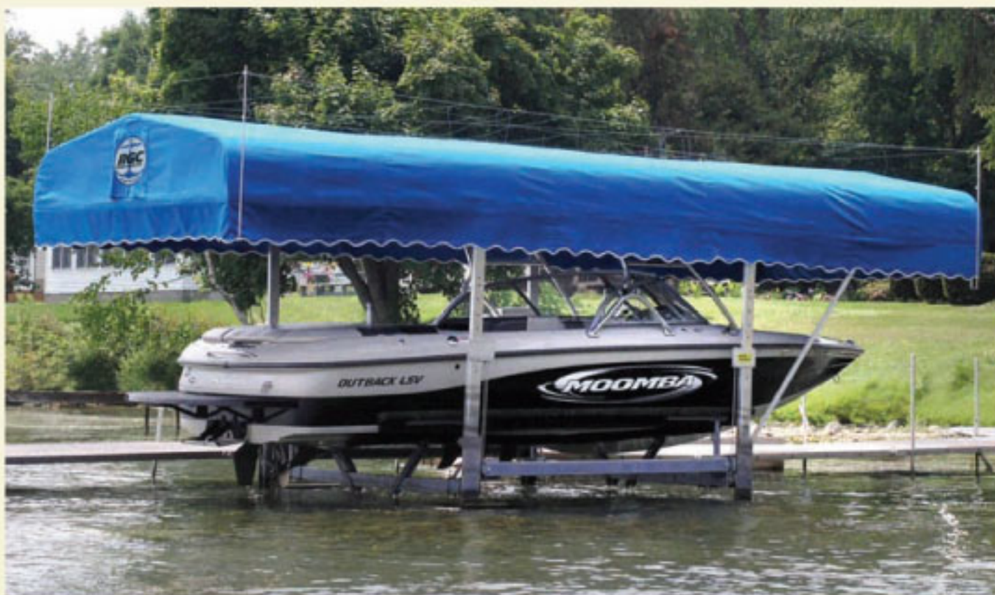
VL45116 with Pivoting Wood Bunks, Wood Guide-Ons, Pacific Blue Canopy and Seagull Eliminator Kit

Customize your lift with Canopies, Bunks, Guide-Ons, Power Drives, Remote Control Drives, Pontoon Brackets and many other quality accessories.